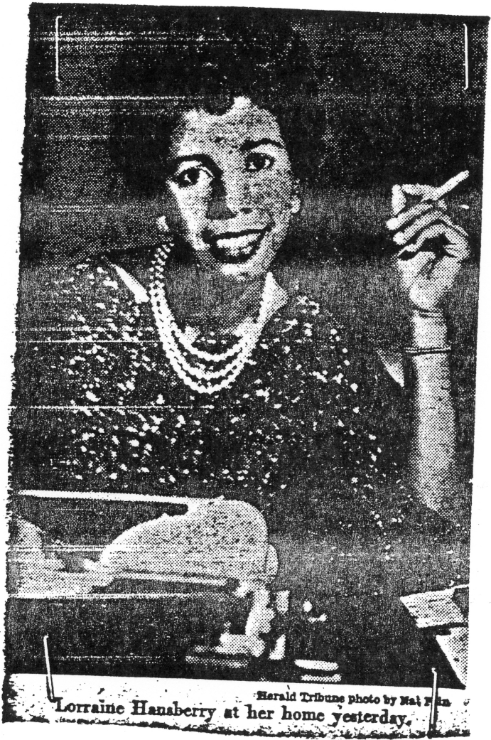
Lorraine Hansberry at her home yesterday.