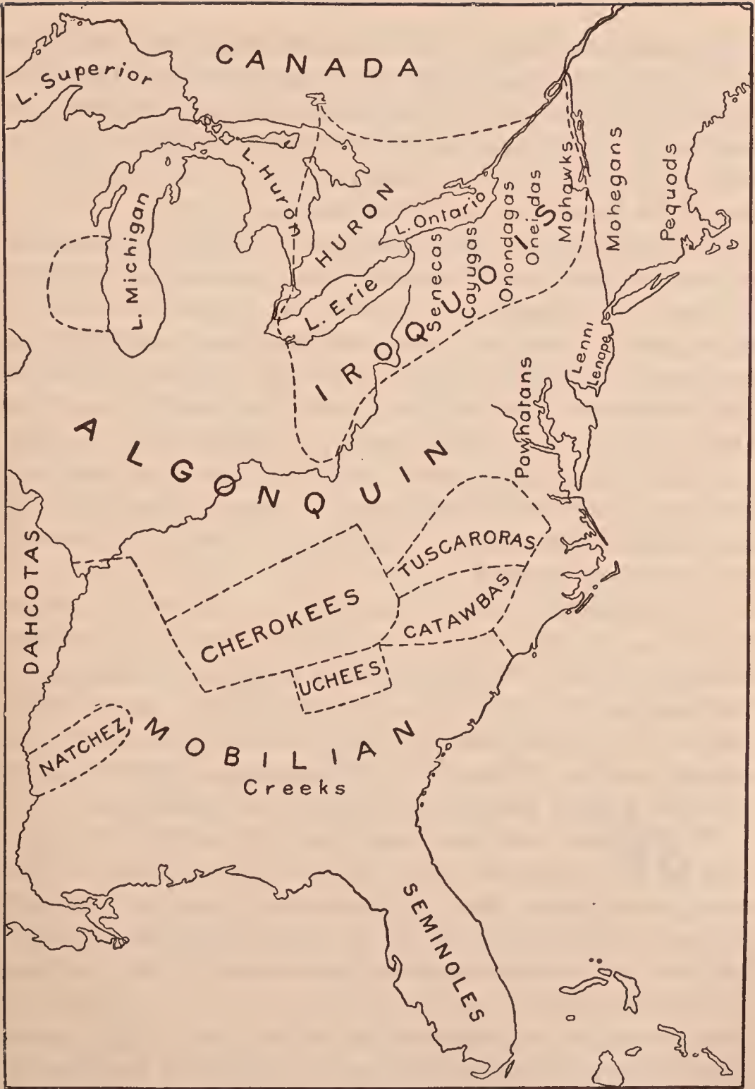
Map Locating Principal Indian Tribes