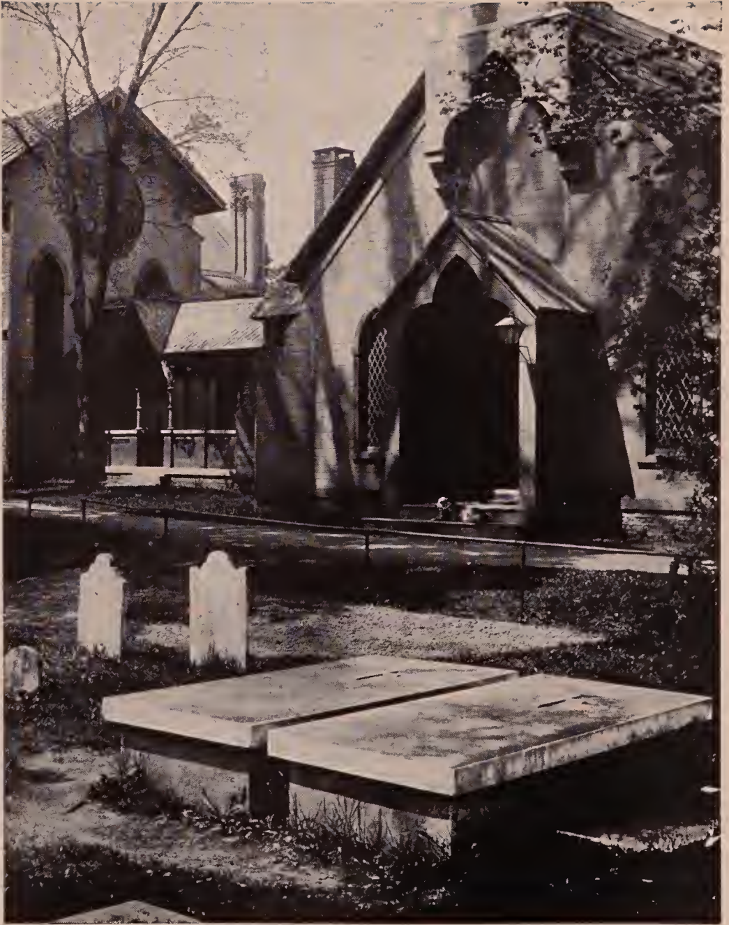
COOPER'S GRAVE, COOPERSTOWN, N.Y.