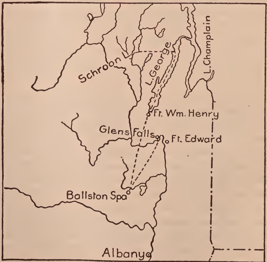
Map of Places Referred to in The Mohicans

appeared to find favor, and, all things considered, it may possibly be quite as well to let it stand, instead of going back to the house of Hanover for the appellation of our finest sheet of water. We relieve our conscience by the confession, at all events, leaving it to exercise its authority as it may see fit.