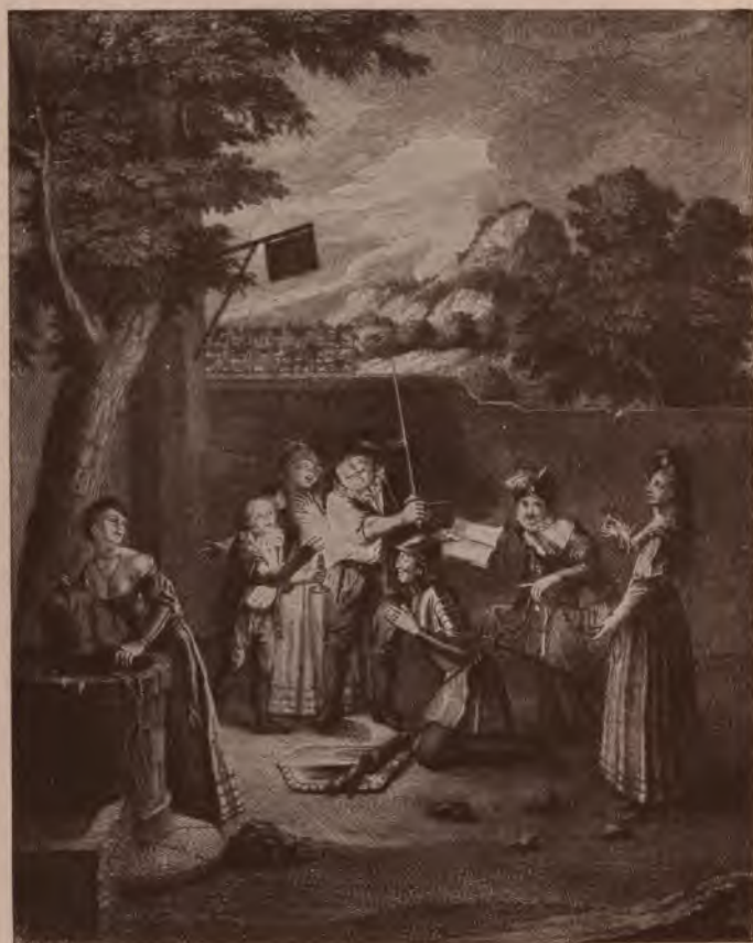
Don Quixote commanded to kneel