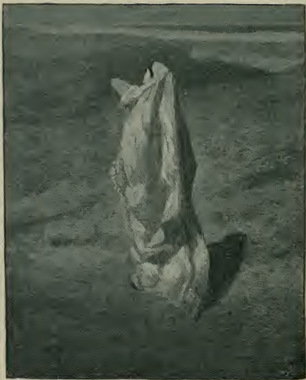
"JUDITH." Page 173.