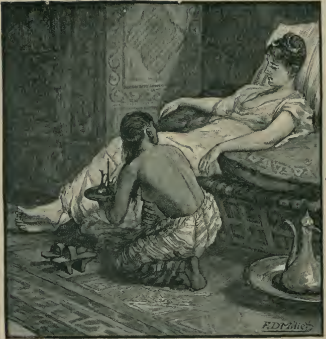
"DRESSING THE BRIDE." Page 21.