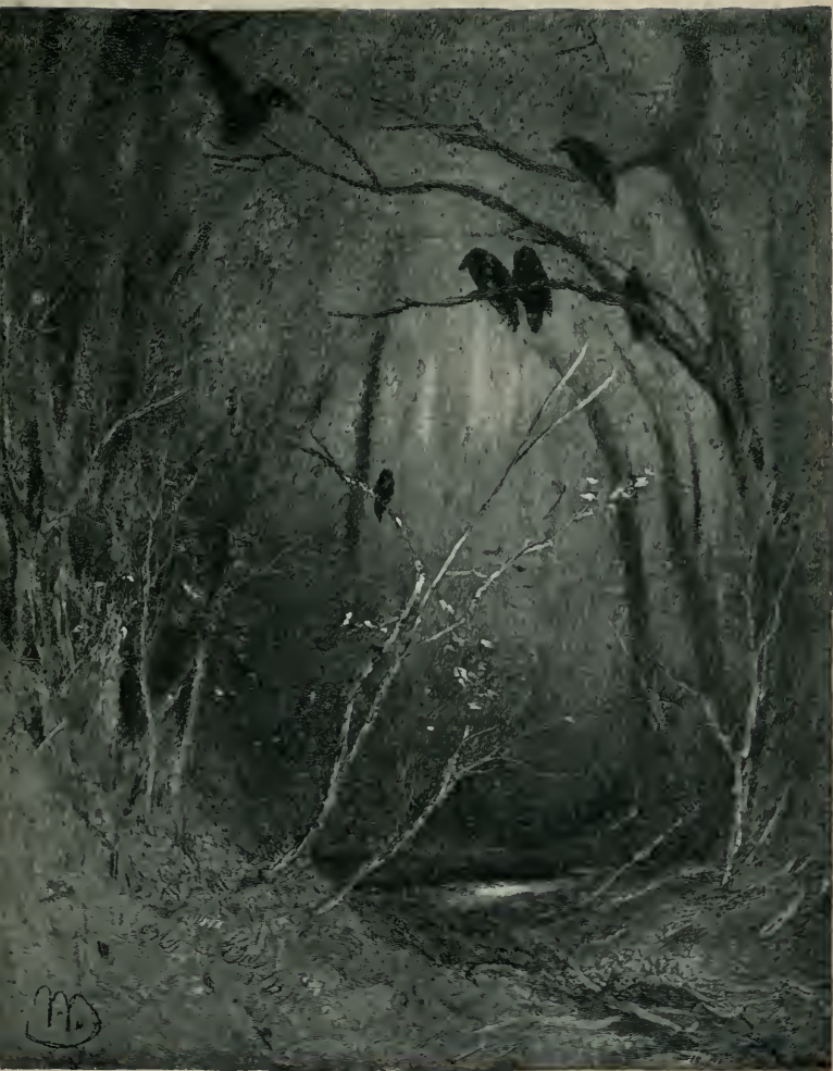
" FABLE." Page 56.