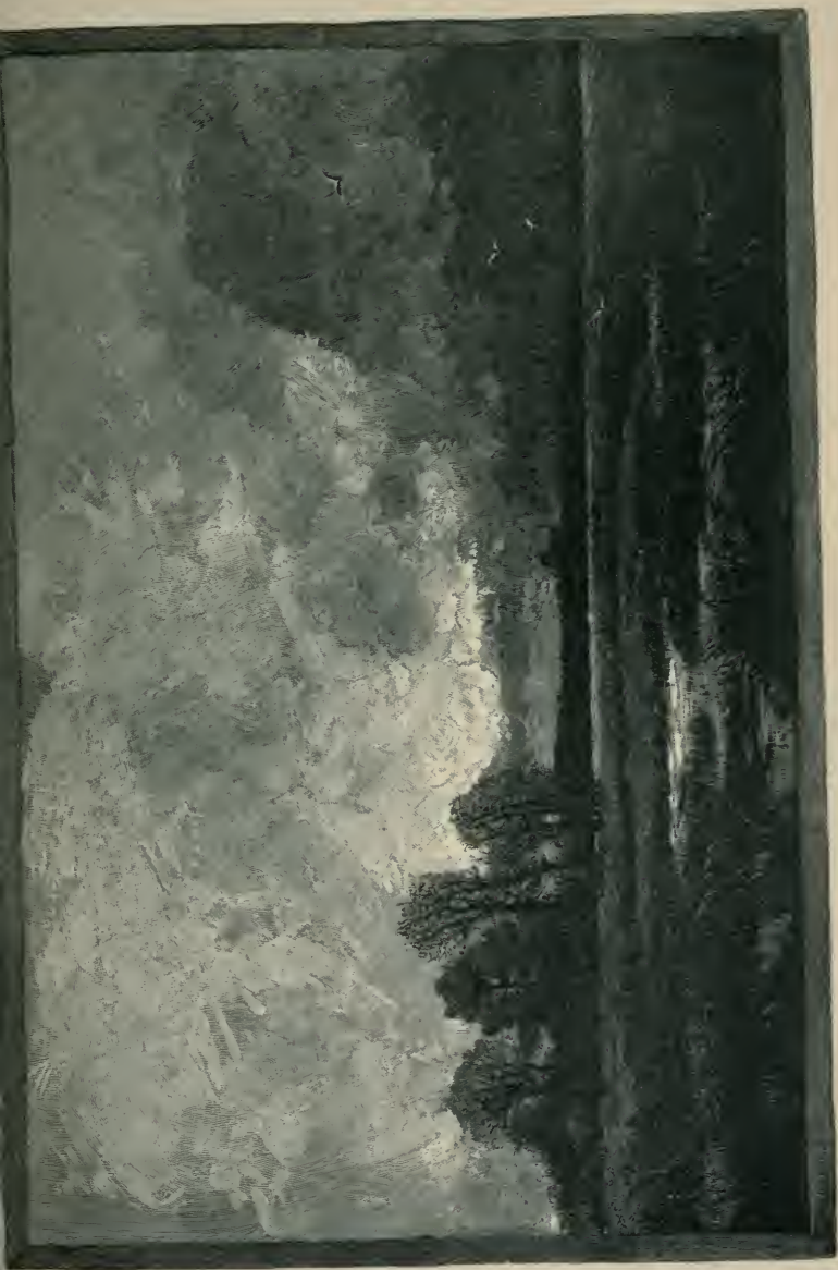
"SPRING IN NEW ENGLAND." Page 68.