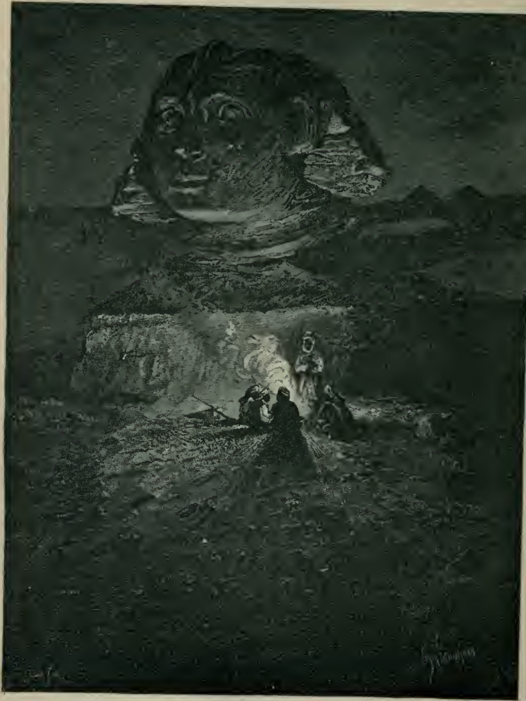
"EGYPT." Page 203.