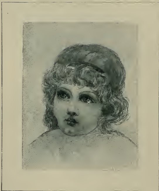
"BABY BELL." Page 73.