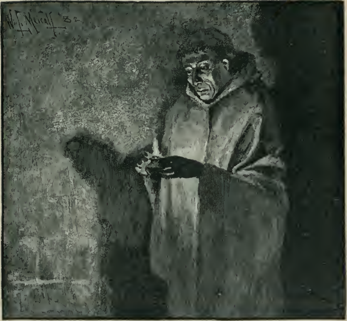
"FRIAR JEROME." Page 116.