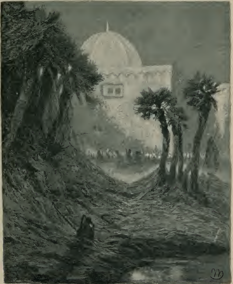
"WHEN THE SULTAN GOES TO ISPAHAN." Page 28.