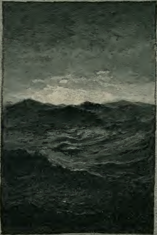
"MOONRISE AT SEA." Page 223.