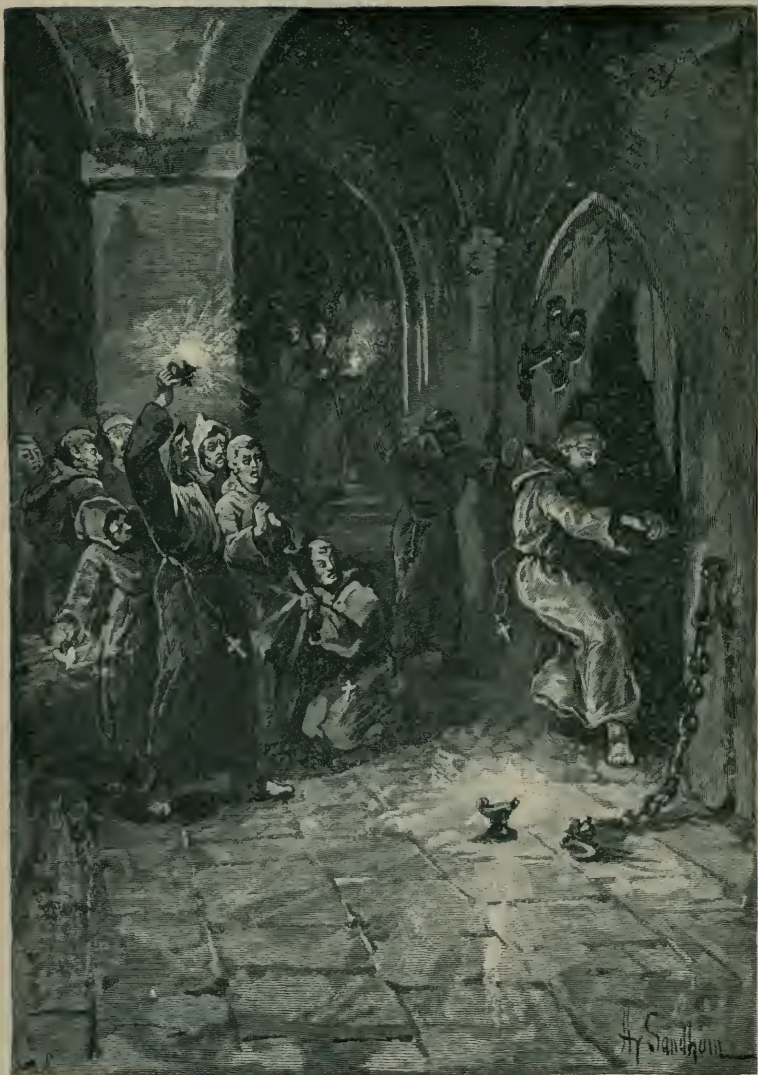
"LEGEND OF ARA-CÆLI," Page 163.