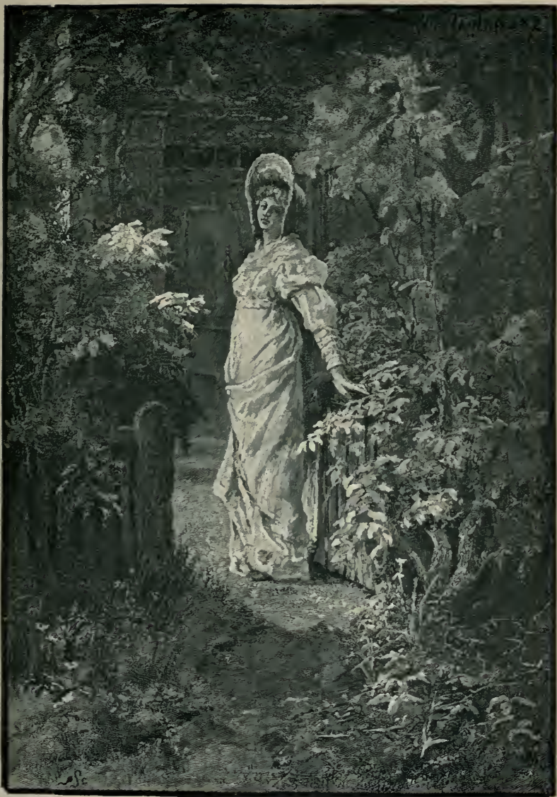
"THE QUEEN'S RIDE." Page 98.